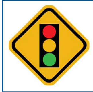
Traffic lights ahead